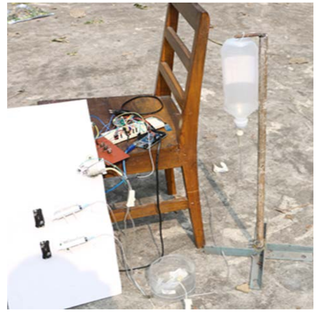
Fig. 1. Automatic IV fluid feed system

IV chord is connected to the needle and other part of the chord is connected the main line. By flowing through the line, pa-